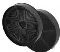
Carbon filter for hood Greentek FWN185