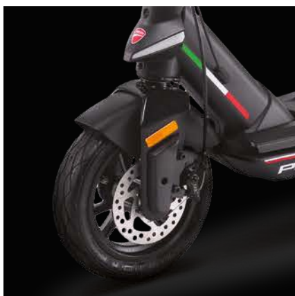
10" tubeless tyres