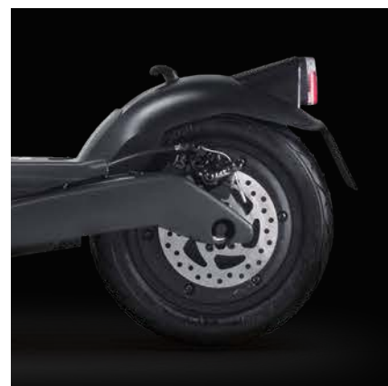
Front and rear disc brake with KERS