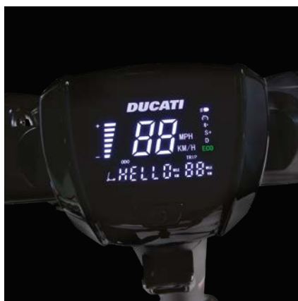
Wide 3.2" LED display with USB port