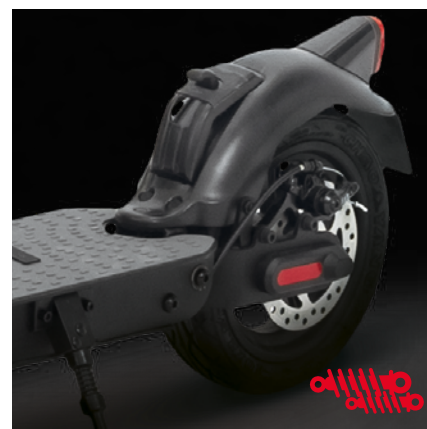
Independent rear suspension