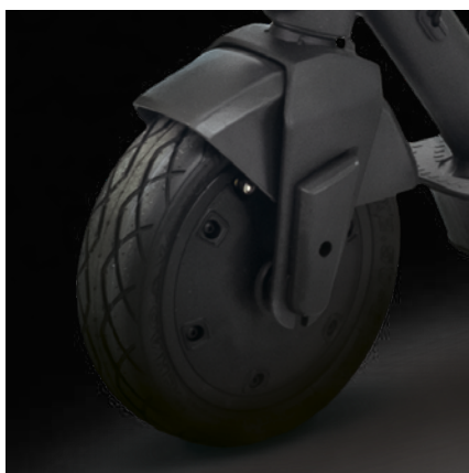
10" Tubeless tyres