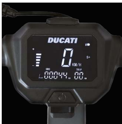
Wide 3.5" LED display